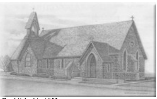
Established in 1832