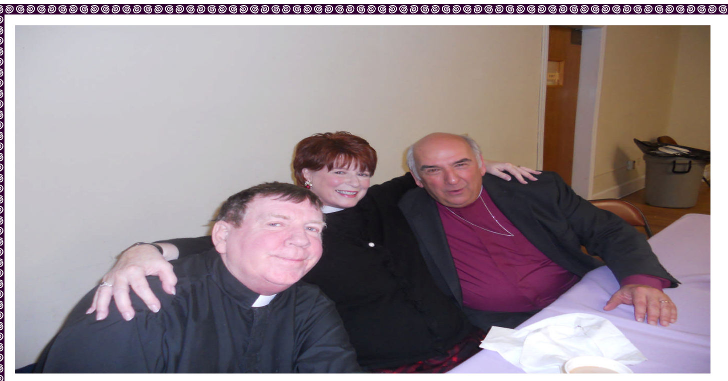
Beverly's Retirement Party