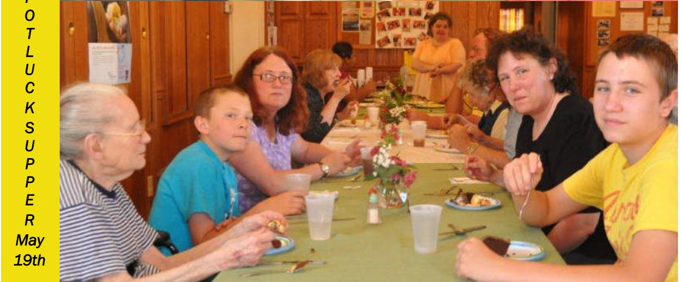
P O T L U C K S U P P E R M a y 1 9 t h