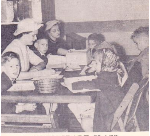
THIRD GRADE CLASS