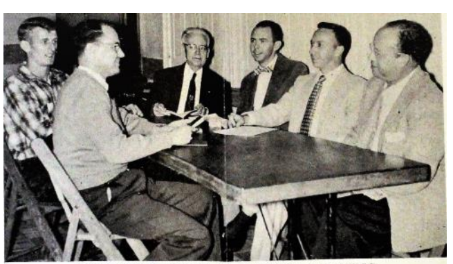
BROTHERHOOD OF ST. ANDREW MEETING