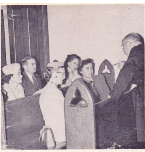
ADULT CLASS MEETS IN CHURCH