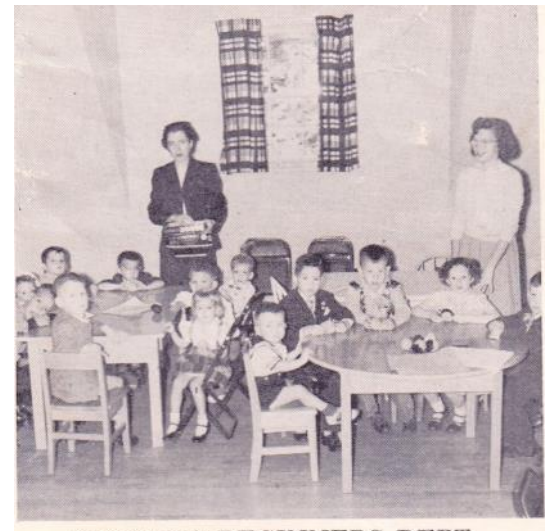
GROWING BEGINNERS DEPT.