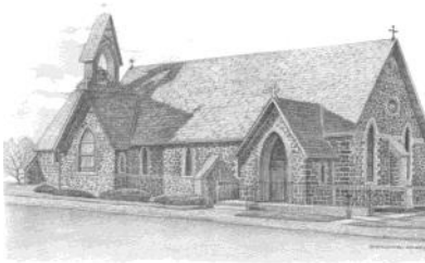
Trinity Episcopal Church